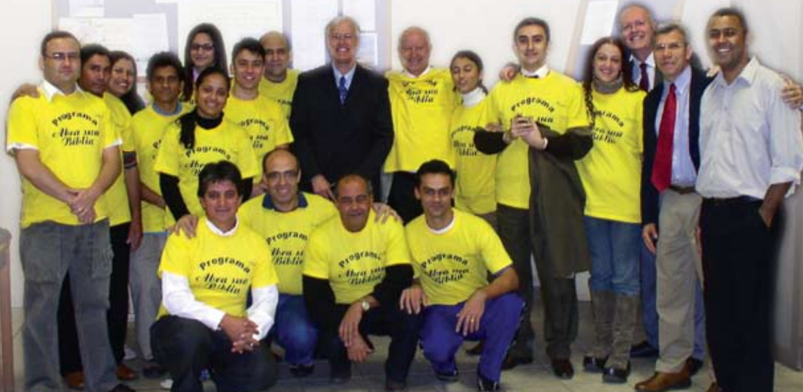
Wearing yellow T-Shirts are Members of the Brazil campaign Response Team.

In the small village of Kusitu, Malawi, over 1500 people walked