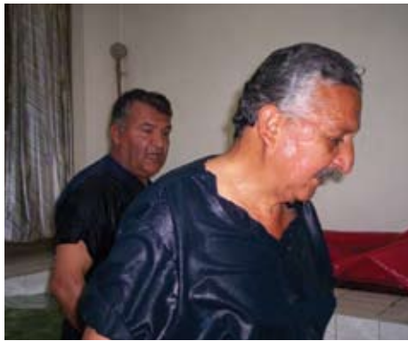
After the Ecuador campaign, after directed Bible study, a soul is obedient to Jesus.

On the surface you would not think that the countries of Malawi, Ecuador, and Brazil would have much in common. There is a vast difference in size and in population base. They range from poor, third world countries to highly developed nations. Herald of Truth ministry teams have been in all these places recently and we were struck by how similar the experiences were. In Ecuador and Brazil, we were conducting follow-up meetings for the country wide television campaigns. In Malawi, we did leadership training, youth rallies, and campaigns as follow-up to our nationwide radio program and to initiate a major literature distribution effort.